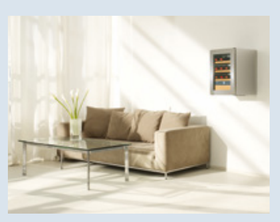
Wall-mount option: The WKes 653 wine cabinet can be wall-mounted as an attractive eye-catcher with convenient access for serving!

LED lighting: For ideal presentation of your best wine, the WKes 653 features LED lighting with dimmer function and separate switch. As LED lights emit minimal heat and no UV radiation, wine can be showcased bathed in light for lengthy periods without compromising its quality.