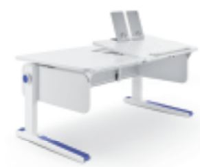
Champion • right up 752211