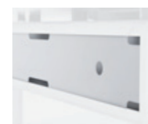
Cable duct cover 702050