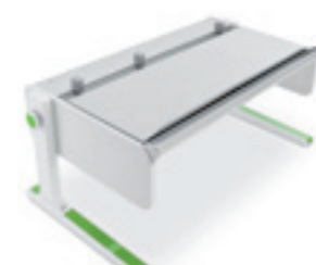
Drawer cover 702523