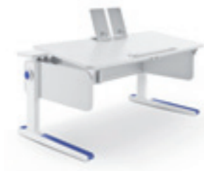
Champion • front up 722211