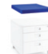
Pad S see below