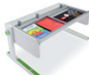
Giant drawer 702513