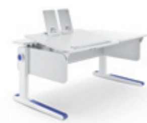
Champion • left up 742211