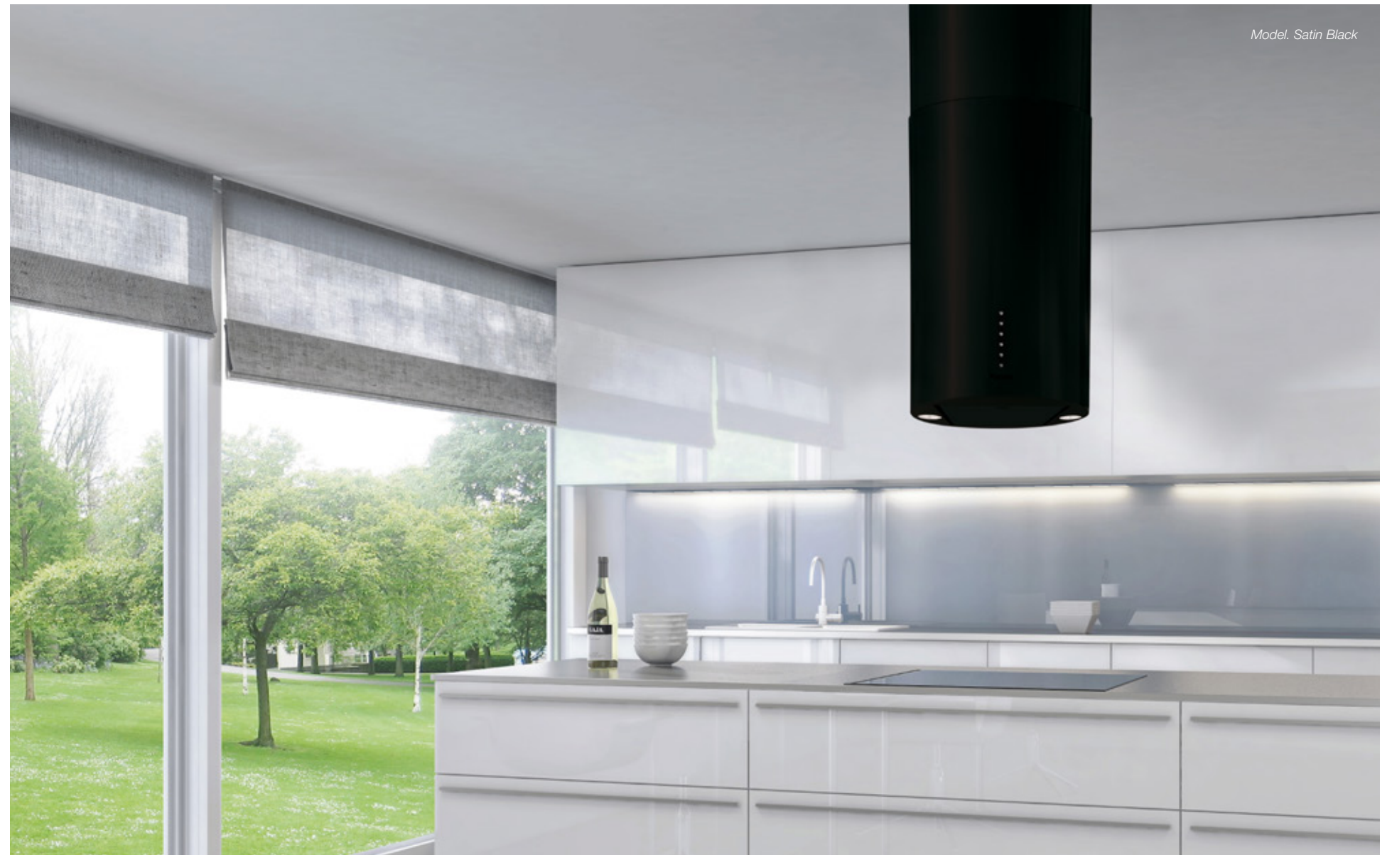
Model. Satin Black